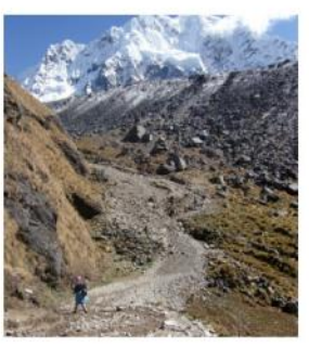
FOLLOW THE OLD ROUTE OF THE INCAS, EXPLORE THE ANDES AND DISCOVER THE MYSTERIES OF MACHU PICCHU